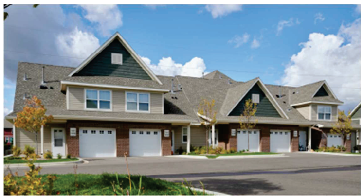
BLDG. TYPE 1,3 AT PRESTWICK PLACE IN ROSEMOUNT, MN